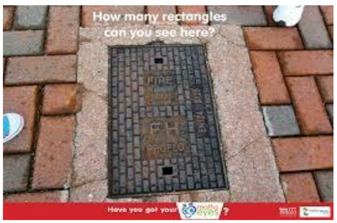
Question: What is this picture of? How many rectangles can you see in this picture?

Let's take a look at some Maths Eyes examples: